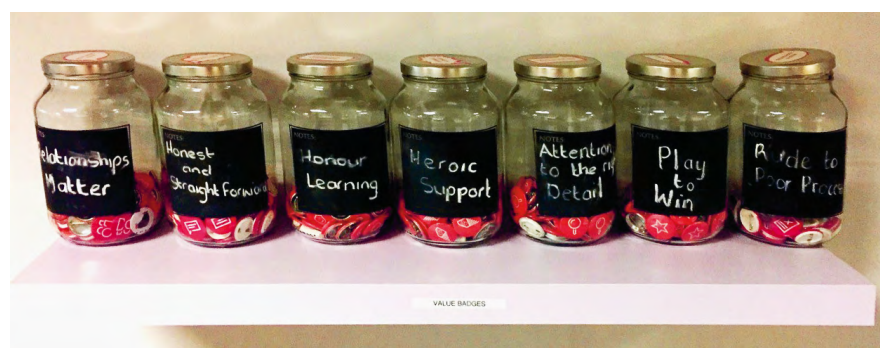
Figure 3: Value Badges.