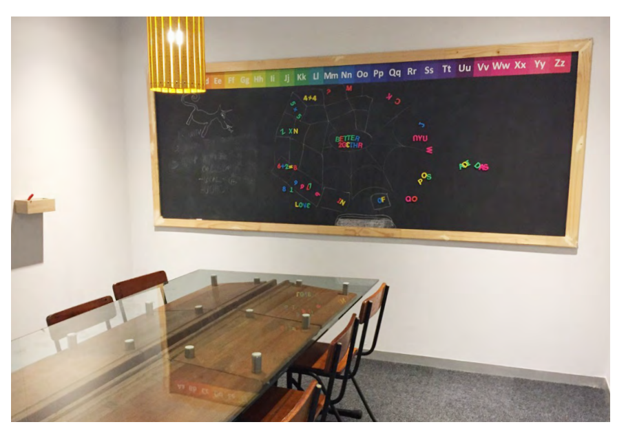
Figure 2: One of the Meeting Rooms at GetSmarter's office in Cape Town with furniture in line with the education theme.