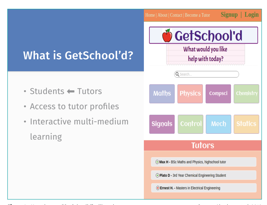
Figure 4: How the app "GetSchool'd" will work.

The Global Information Technology Report (Baller and Dutta 2016) reflects the results of an initiative of the World Economic Forum, which globally assesses education systems. Regarding maths and science education, essential for many jobs in the digital economy, South Africa ranked 139 out of 151 countries, receiving the highest African score. ICT solutions for the support of students have been successfully launched in recent years, but students still struggle to find solutions catering for the multi-lingual and multi-cultural challenges in tutoring.